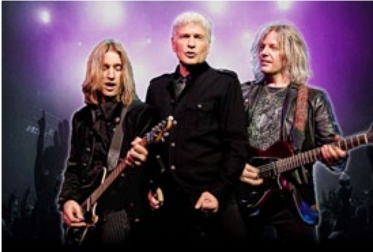
Dennis DeYoung and the Music of Styx

Dennis DeYoung and the Music of Styx will be on stage Friday September 4. DeYoung's voice is one of the most recognizable in the world. He has recorded seven solo albums including "Desert Moon", which achieved top 10 status.