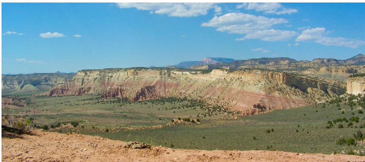
Grand Staircase-Escalante National Monument, Utah