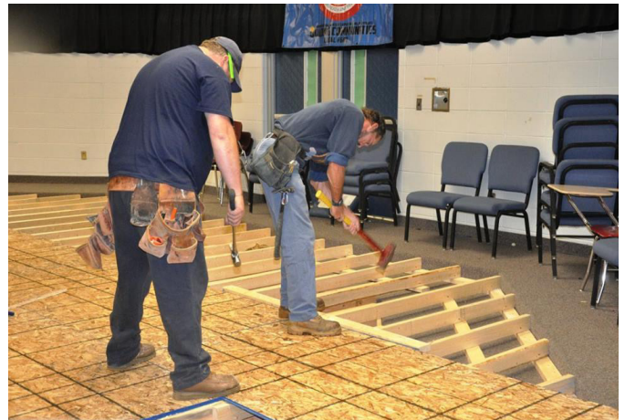
Carpenters volunteering their time to build a stage in the theater at Taylor Truman High School.