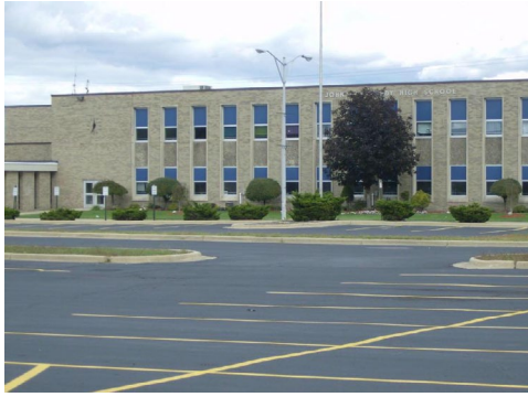
JFK High School