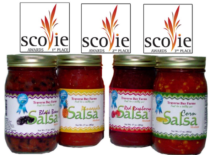
Traverse Bay Farms award winning products.