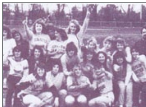
Powder Puff Team

► The Powder Puff game was won by the '84 class girls.