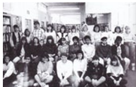
After Hours Club

cultural events in Metropolitan Detroit going to theater, concerts and art exhibits.