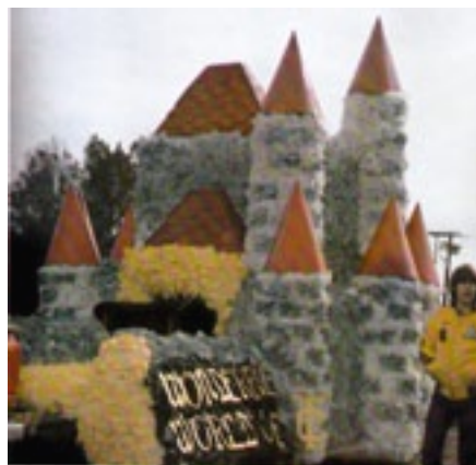
The Senior Float...Cinderella Castle

1982 — Do you remember the Homecoming Parade theme "World Tourist Attractions". The seniors float Cinderella's Castle was the winner.