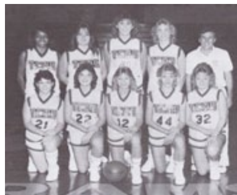
Girls Basketball Team