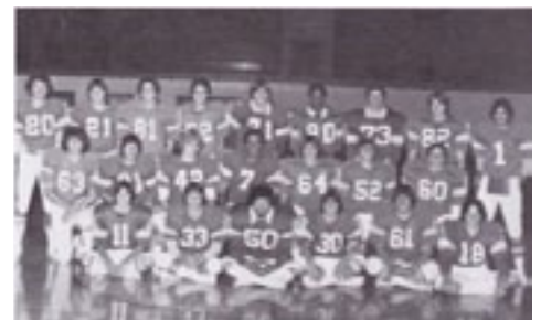
Eagle's Football Team

The Millage Parade and students marching to pass Millage Bill.