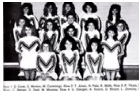
Pom Pom Squad

Pom Pom Squad took 1st place at the summer camp and qualified for the national.