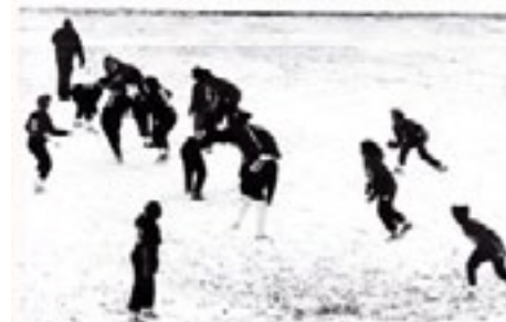
Powder Puff Game

Pom Pom Squad took 1st place at the summer camp and qualified for the national.