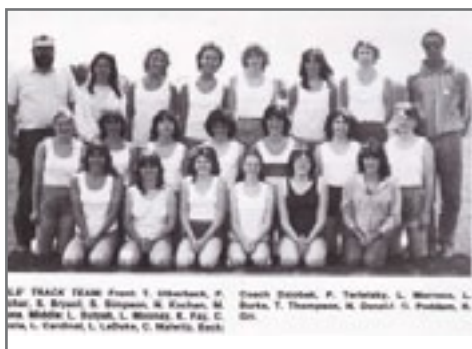
Girl's Track Team

German Club members went to Germany during Spring Break.