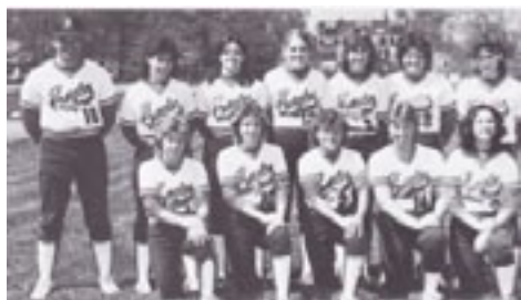
Girl's Softball Team

Girls Softball Team won District Championship.