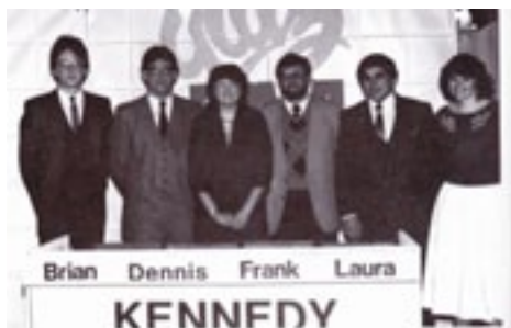
Quiz Bowl Team