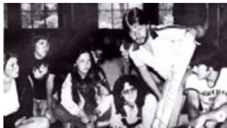
Youth Government Team

Youth in Government traveling to West Virginia and New York.