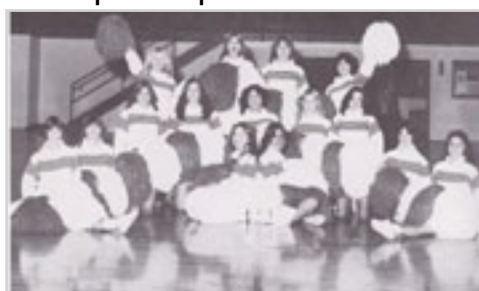
Pom Pon Squad

Pom Pon Squad won 2nd place in the 1979 National Championships.