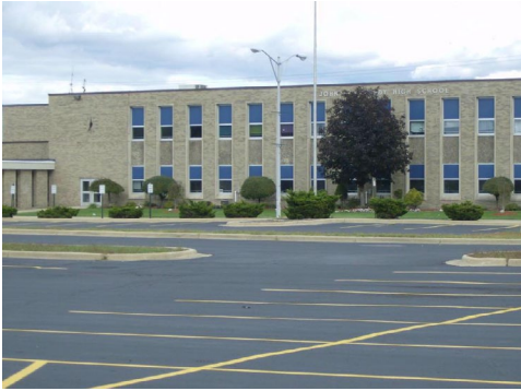
JFK High School