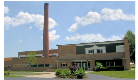
Taylor Center High School