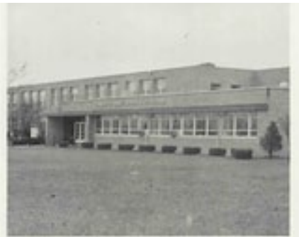
Charles E. Brake Junior High School Taylor, Michigan