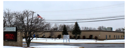
Harry S. Truman High School