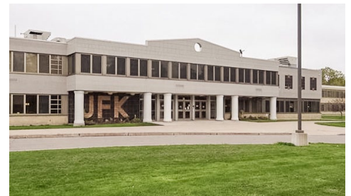
JFK High School, Cheektowaga, NY

Dingell's local office and asked her to research the question. The Congressional Research Service provided her information on a John F Kennedy High School in San Antonio, Texas. On September 10, 1962 their Board of Trustees voted on the name of their school, believing it to be the first John F Kennedy High School in the country. Later, I went to Wikipedia, the free encyclopedia, and asked for a list of John F Kennedy High Schools. In that list I found that a school in Cheektowaga,