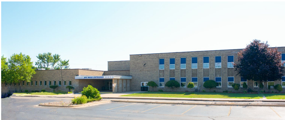
JFK High School, Taylor Michigan