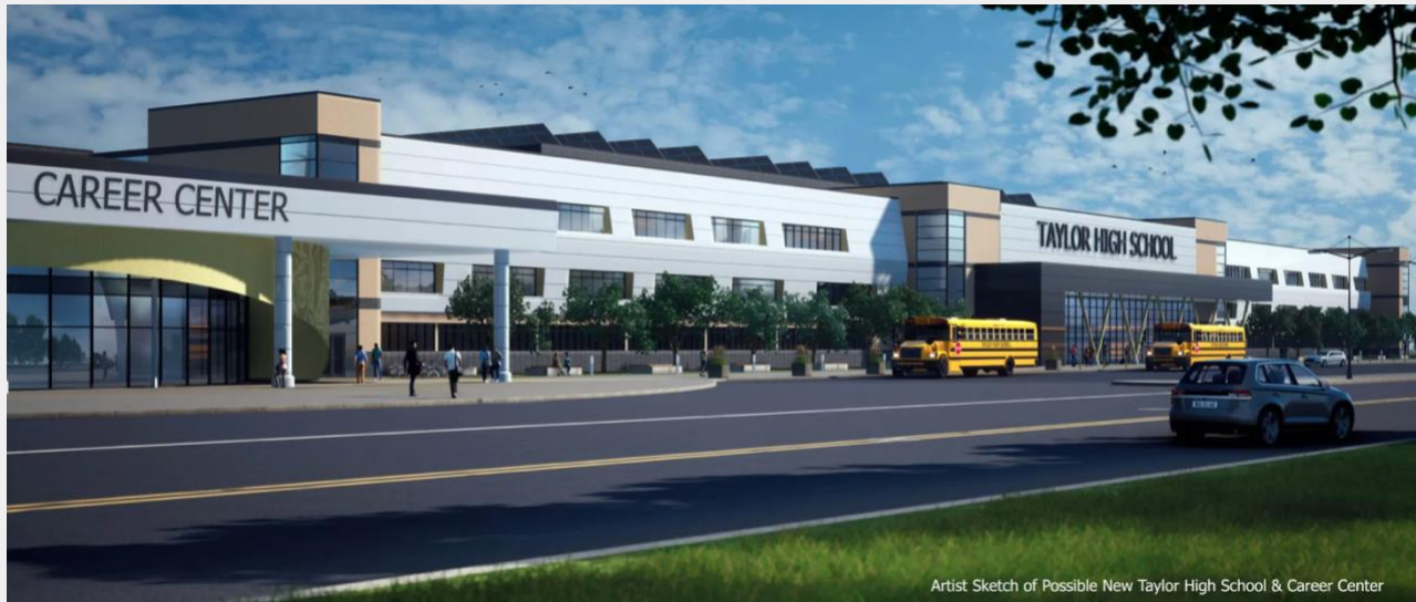
Artist Sketch of Possible New Taylor High School & Career Center

TAYLOR RESIDENTS PASS $130 MILLION BOND PROPOSAL – November 2, 2021 over 55% of voters passed the first significant bond proposal since 1969.